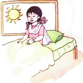
1. Get up for school