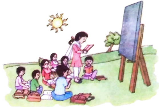
3. Read a story in school