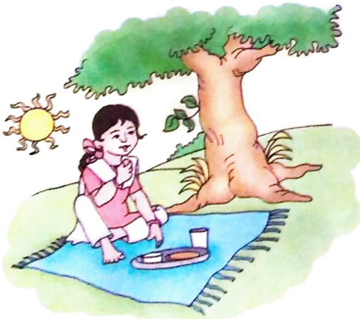
4. Eat lunch