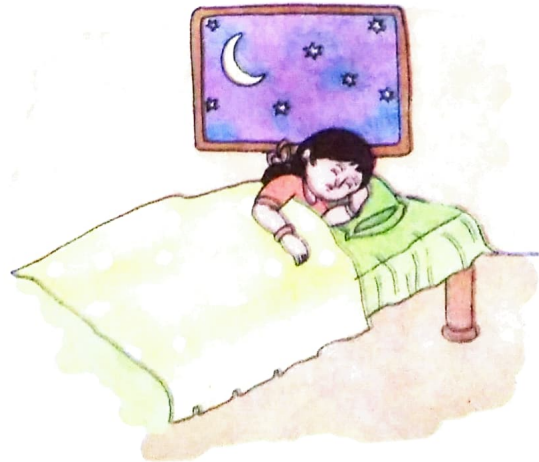
7. Go to bed