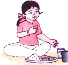
2. Eat breakfast